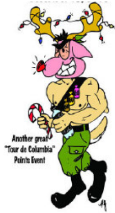
Another great "Tour de Columbia" Points Event "Rudolph's Rampage" Half Marathon & 10k