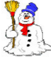
COLD WINTER'S DAY