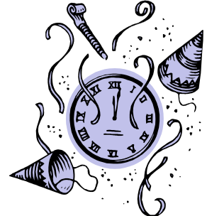
Resolution Run 10K